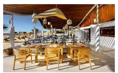
BEACH AT HARD ROCK

Type of cousine: Mediterranean Regular set-up: 180 seated Preferred Service: Beach time!