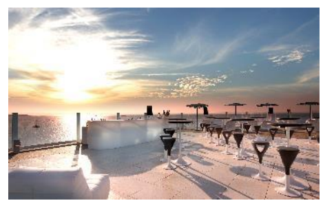
THE NINTH ROOFTOP

Type of cousine: American bar Regular set-up: 240 seated (imperial style) Preferred Service: Open bar till late